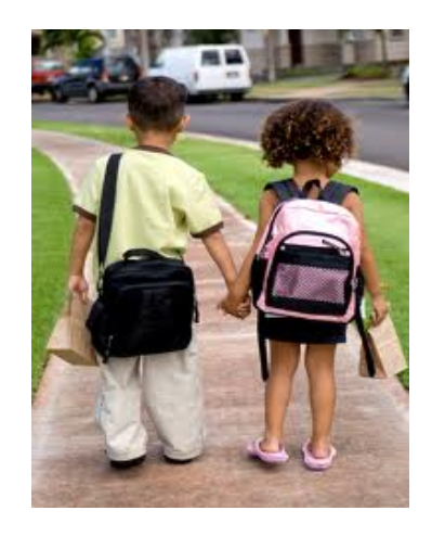
Birth to 5: Watch Me Thrive!

\begin{tabular}{l} Celebrating \ Developmental \ Milestones \ \bullet \ Implementing \ Universal \ Screening \ \bullet \ Improving \ Early \ Detection \ \bullet \ Enhancing \ Developmental \ Supports \end{tabular}